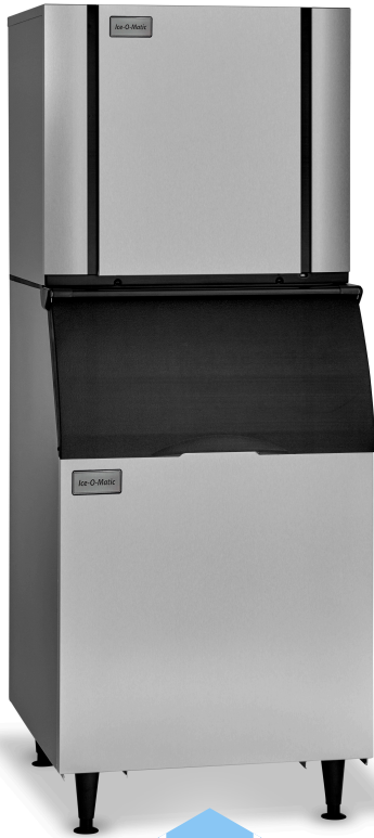
CIMO836 ON B55